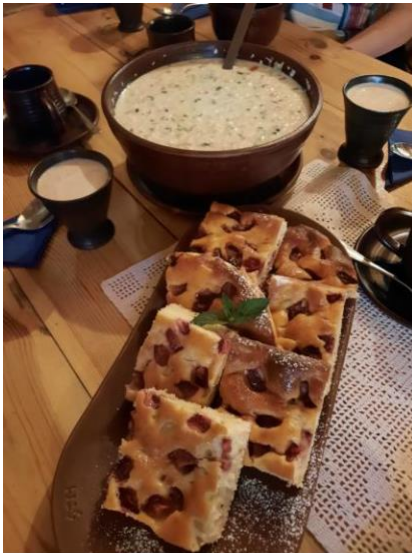
We had an early lunch at cafe Tsaimaja, with typical local food. A cold soup made of cucumber and other vegetables. Cold drinks made of sour cream, kefir and 'kama', a mixture of beans, potatoes, unions and meat and special cumin tea.