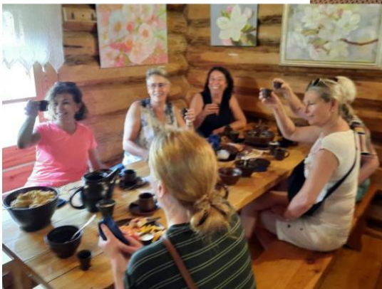
We toast with a shot of strong liquor made of apples. (59% alcohol)