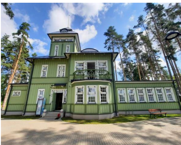
We continued our tour with a visit of the beautifully situated General Reeks (1890 – 1942) house.